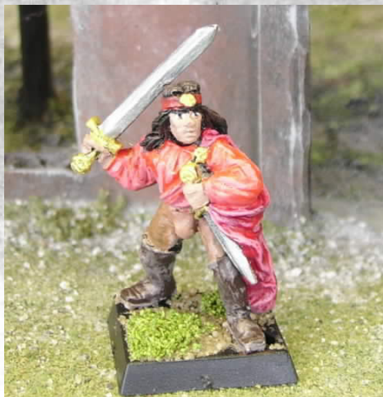
ESTALIAN DIESTRO PAINTED BY T. BELL

Main Gauche: The main gauche is a special dagger, which Diestros use with their offhand (which is inmost cases the left hand, hence the name). Any Estalian Diestro has the option to either use this weapon as a dagger, thus gaining an additional attack, OR to parry a blow with it as if it was a sword. In the latter case, they gain NO additional attack. The player may choose each turn in which way the fighter will use the main gauche.