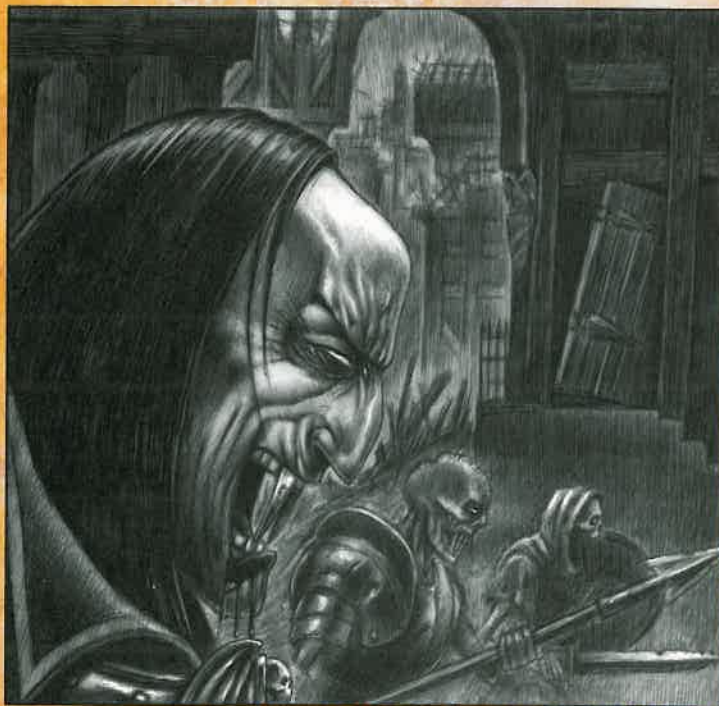
A Vampire with his foul minions.

Now Mordheim is a city where death lurks behind every corner, danger fills all the shadowy alleys and ruined, labyrinthine streets. Death comes quickly here, in guises and forms too horrible to contemplate. Yet the promise of riches lures the avaricious as a candle lures moths, and thus more and more warriors come to the City of the Damned. Fortune seekers, zealots, madmen and mercenaries, the twisting streets and catacombs of Mordheim engulf them all, and the shadows claim them for their own.