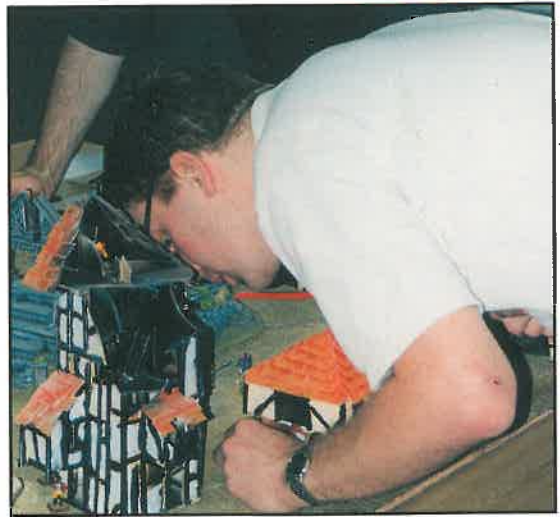
You only need line of sight to the enemy, Jim – you don't have to be able to smell them too!