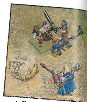
A Chaos Cultist warband slugs it out with a mercenary Ogre.

Let's get down to business then. At the moment my stalwart comrades-in-arms here in the Studio are busy with a new game idea. Whether it ever becomes a finished game in its own right and hits the stores in the future is of course unknown. However this series of articles will show how Games Workshop games are born and developed. So how did it all get started...?