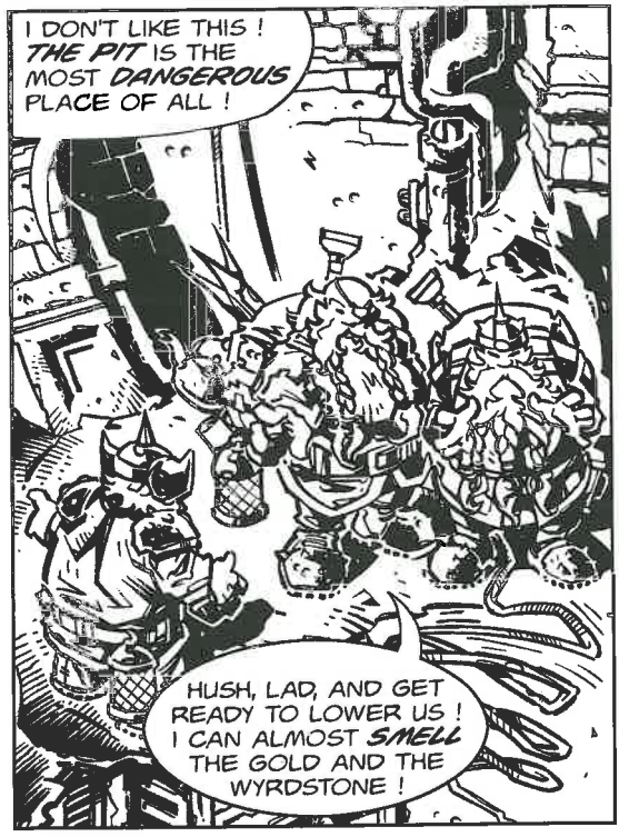
Here a band of Dwarfs use a rope and hook to climb down into 'The Pit' in last issue's Mordheim comic strip.

A warrior equipped with a rope and hook may re-roll failed Initiative tests for climbing up and down sheer surfaces.