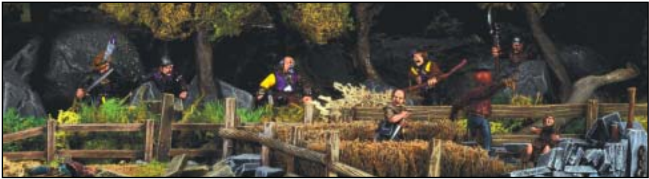
An Ostermark Warband sneaks up on an unsuspecting farmer

Fire: The warbands are merciless and ready to raze the farm to the ground once they have taken all that is of any worth. Every member of each player's warband starts the game carrying a torch which may be lit and thrown into a building once it has been looted. The rules for torches are given in the Empire in Flames rulebook (p.16) but are summarised below for your convenience. A torch acts as a lantern (if any Hero also possesses a lantern this may be used to burn a building down in the same way), any model equipped with one causes fear in all animals. As a weapon it is treated as a club but with a -1 To Hit modifier and any wounds caused by it cannot be regenerated by any model with the Regeneration special rules. The torch will only last for one battle. A model may torch a building at any time. If they are inside a building (setting fire to furniture and other belongings) then the fire starts automatically. They may also throw the torch up to 6" away to light a building and the fire will start on a roll of 2+ on a D6 (a 1 indicating it has bounced off a roof or merely sputtered out). Once a building is lit, roll a D6 at the start of each player's turn (not including any farmers who might be on the board) to discover if the fire is spreading. Add +1 to the dice roll for each turn the fire has been burning.