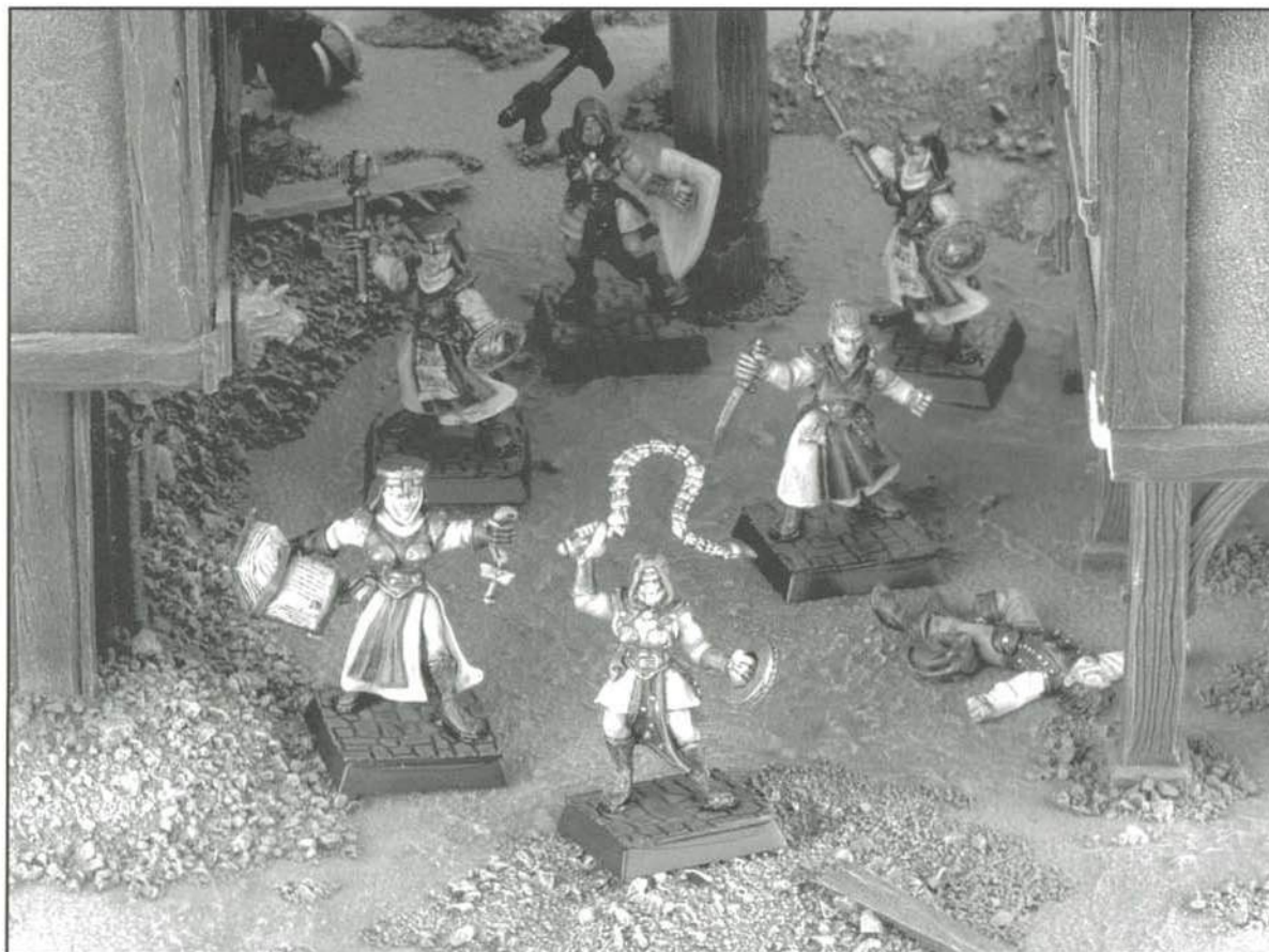
The Sisters of Sigmar staunchly defend their fortress abbey

The game ends automatically when a warband manages to defeat the Sisters guarding the tome and leave the building (as they are able to readily find a sewer grate anywhere and get away).