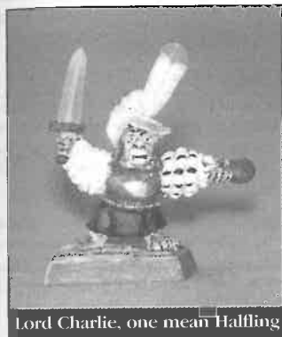
Lord Charlie, one mean Halfling

Leader: Any Warrior within 6" of the Moot Elder may use his Leadership when taking Ld tests.