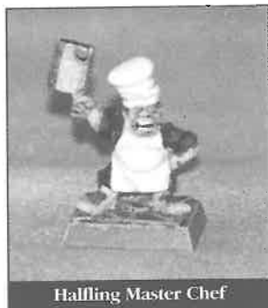
Halfling Master Chef

Weapons/Armour: The Halfling Master Chef may be equipped from the Halfling master Chef utensils list.