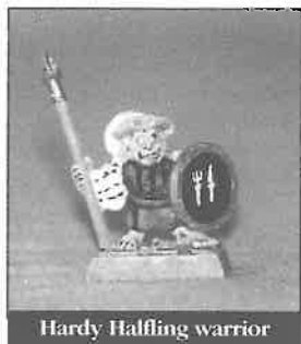
Hardy Halfling warrior

Weapons/Armour: Halflings are equipped from the Halfling equipment list.