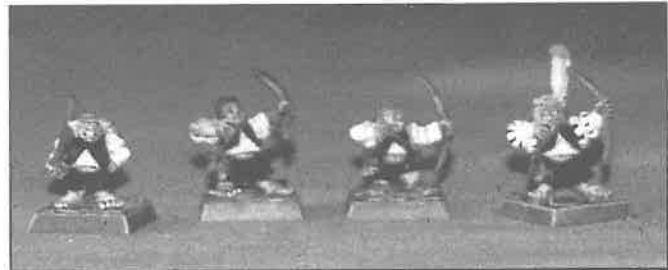
Halflings - ready to take Mordheim by storm!

Warriors: Your warband may include any number of Halflings.