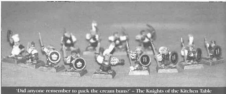
'Did anyone remember to pack the cream buns?' - The Knights of the Kitchen Table

Weapons/Armour: Halflings are equipped from the Halfling equipment list.